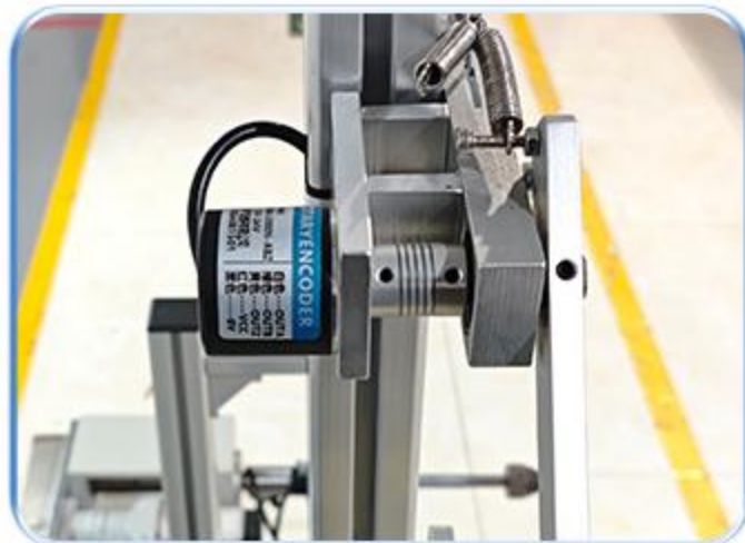
NO.2 Meter sensor + Wire storage rack