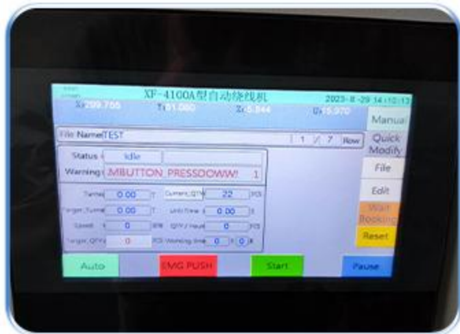
NO.1 PLC touch screen