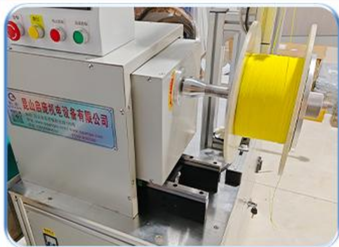
NO.3 Movable take-up rack